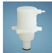
Small versions when only low flow rates are required