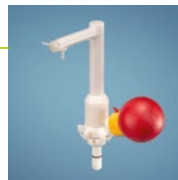
Dispense heads with manual hand or foot pumps

Our Technical Sales team will be happy to help you.