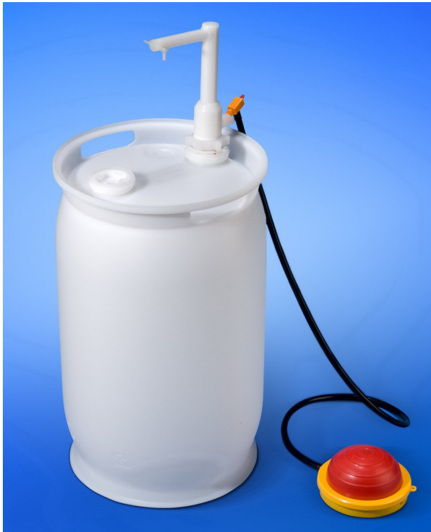
Air operated dispense head with foot pump.