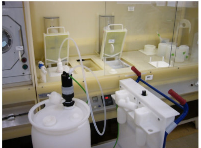
Systems for Customized Solutions

THE LEADING DISPENSE SYSTEM FOR LIQUID CHEMICALS