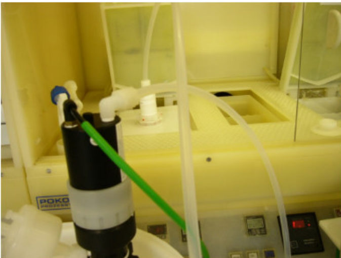
QC Dispense Head with integrated Almatec Pump