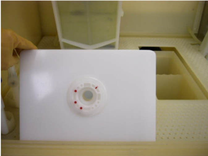
QC Adaptor with Splash Guard