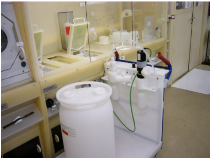
Mobile Filling Station