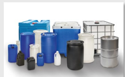
Compatible with all containers. Customized dip tubes.