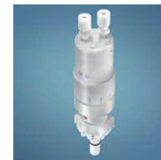
Integrated compressed air-operated diaphragm pumps