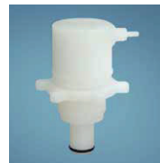
Small versions when only low flow rates are required