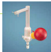
Dispense heads with manual hand or foot pumps

Our Technical Sales team will be happy to help you.