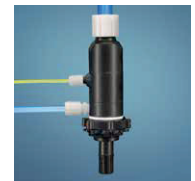
Fill head with injector for N 2 blanketing