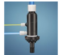
Fill head with injector for N 2 blanketing