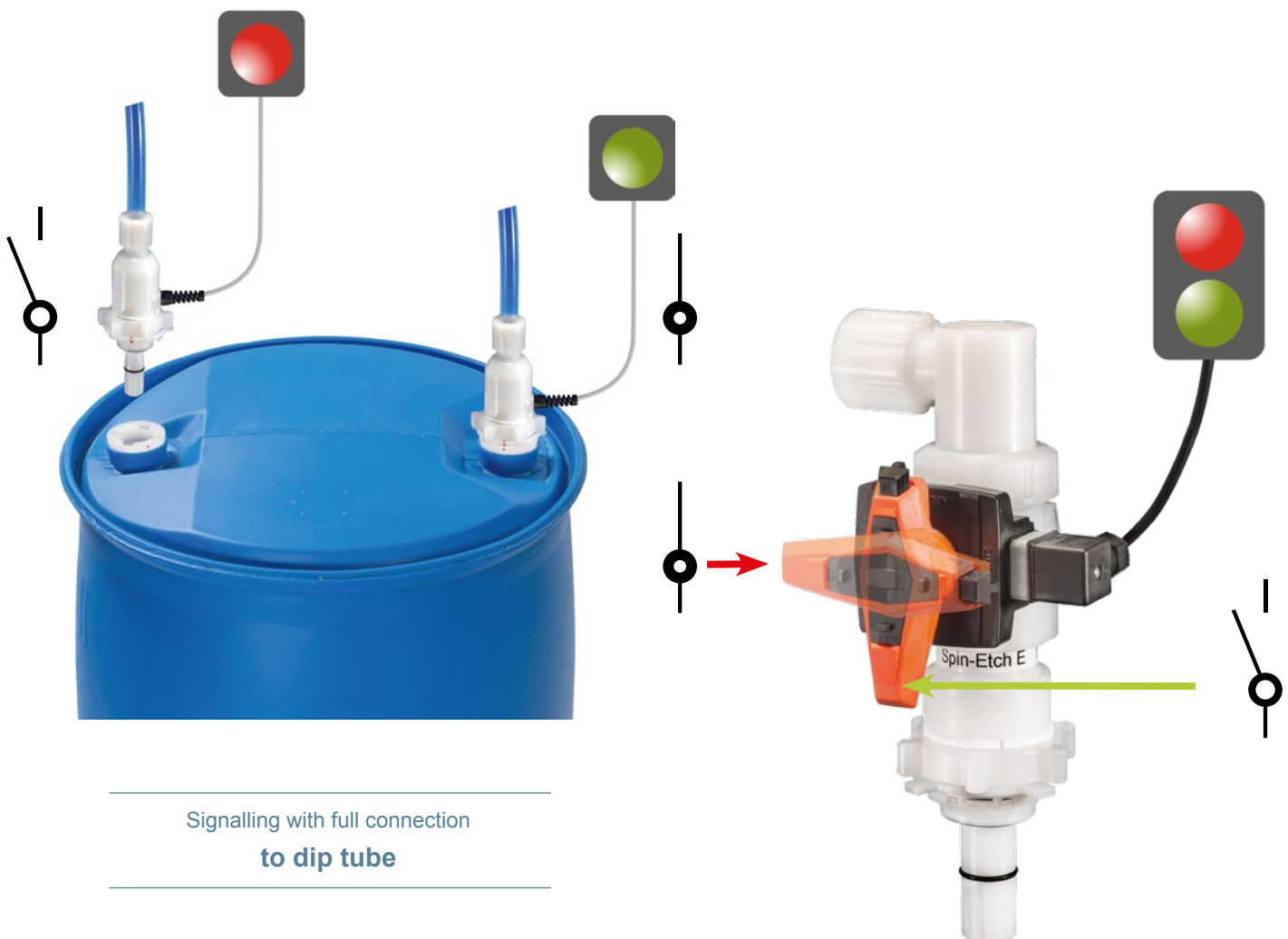
Signalling with full connection to dip tube