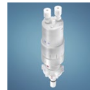
Integrated compressed air-operated diaphragm pumps