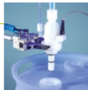
Robot-compatible, for fully automatic operation

Our Technical Sales team will be happy to help you.